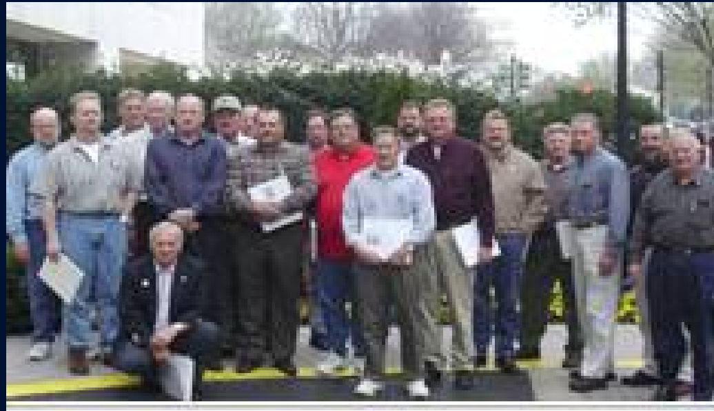
ALC members in Washington, D.C.

To enhance the logging profession, provide a unified voice on logging issues; and cooperate with public, industrial and private timberland owners to further sustainable forestry practices.